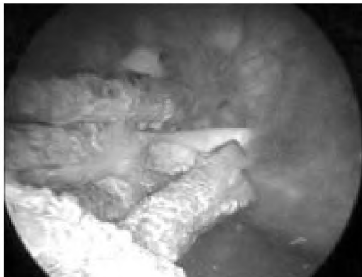
FIG. 1. Cystoscopic image of the bladder dome showing the shunt tubing perforating the bladder wall multiple times. Note the encrustations along the shunt tubing, indicating a long-standing problem.