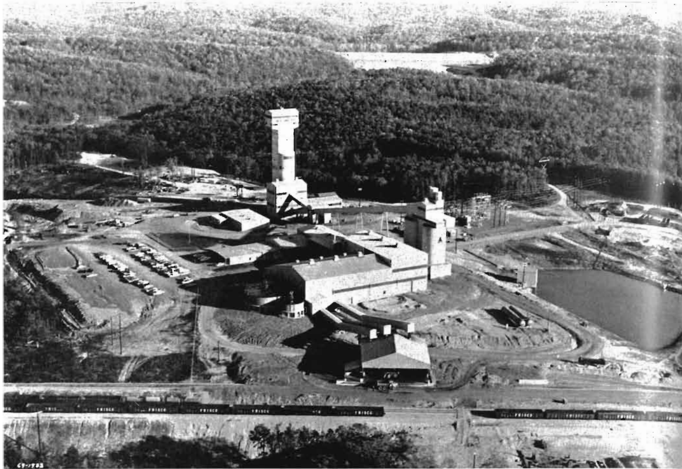
The Magmont mining complex at Bixby, Mo., shows the tailings pond in the background and the fresh water supply pond in the right foreground. Reuse of water gains importance as state governments establish stricter pollution control laws.