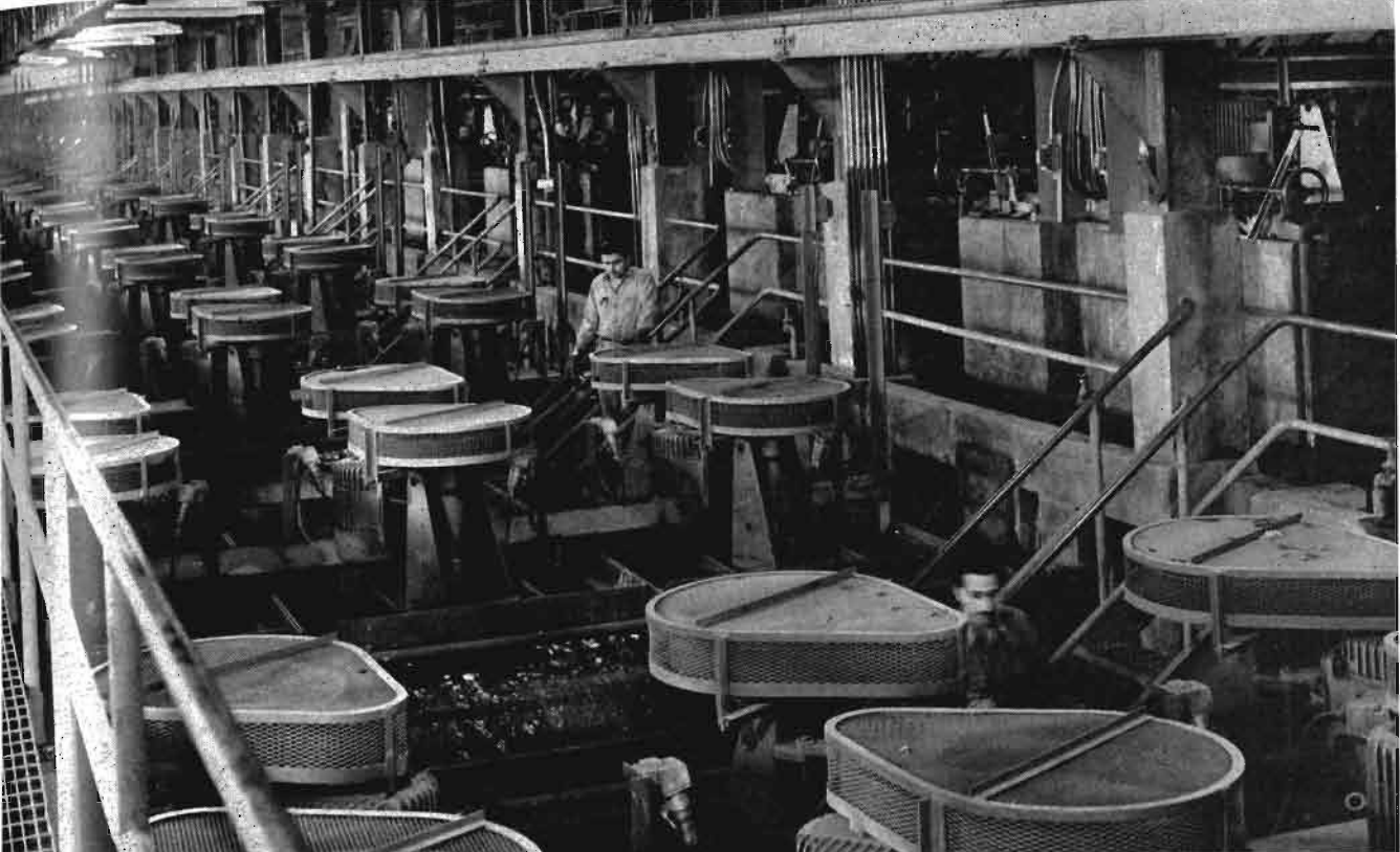
Flotation technology advances with larger equipment (up to 400 cu ft units) and the use of simpler rotors and stators. Concurrently, reagent manufacturers are developing more specific chemicals for the various minerals. Better recovery and grade have resulted.

gation of the hydrodynamics of flotation cells has been made by Arbitrer, Harris and Yap 38 .