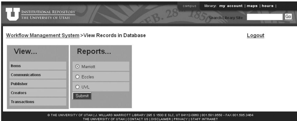
FIGURE 6 Reports.

curate, describe, and maintain access to information—is changing in response to both the rise in digital information and the rise in journal costs. A campus community has the potential to create millions of megabytes of digital information that remain unpublished, uncollected, or unmanaged. 1 Many institutions built repositories thinking content providers would flock to them, but it has been quite the opposite. 2 Repository managers have approached the low deposit rate in various ways. Loughborough University developed relationships with key stakeholders such as the research office, the information services committee, and the program development and quality team. 3 University of Massachusetts Medical School raised their profile by adopting a hosted content site that provided them with robust marketing tools. 4 The University of Cambridge looked at the deposit habits of early adopters (as well as non-adopters) to develop a deposit approach tailored to chemists. 5