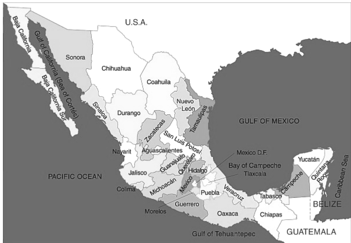
Figure 2. Map of Mexican States (Two participants from this study came from the Mexican States of Jalisco and Michoacán.)

and “generic Christian.” About 8% of the families had three children with autism and two families had two children. The remaining 22 families had one child with autism. Of 34 participants, 33 were partnered and co-parenting. One was partnered and single parenting. Occupations of parents were diverse, ranging from stay at home mothers to engineers and teachers (see Table 1).