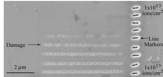
FIGURE 2. Secondary electron image of damage caused by RTA. The doses of the implanted lines range from 1x10 13 ions/cm 2 to 1x10 15 ions/cm 2 , with damage becoming visible around 6x10 13 ions/cm 2 .

damage can be eliminated by etching the surface with HCl prior to RTA to remove excess Ga, which acts to dissolve GaAs at elevated temperatures. Preliminary XTEM analysis indicates that regions amorphized with implanted Ga + doses up to 3x10 13 ions/cm 2 do regrow under the RTA conditions described above.