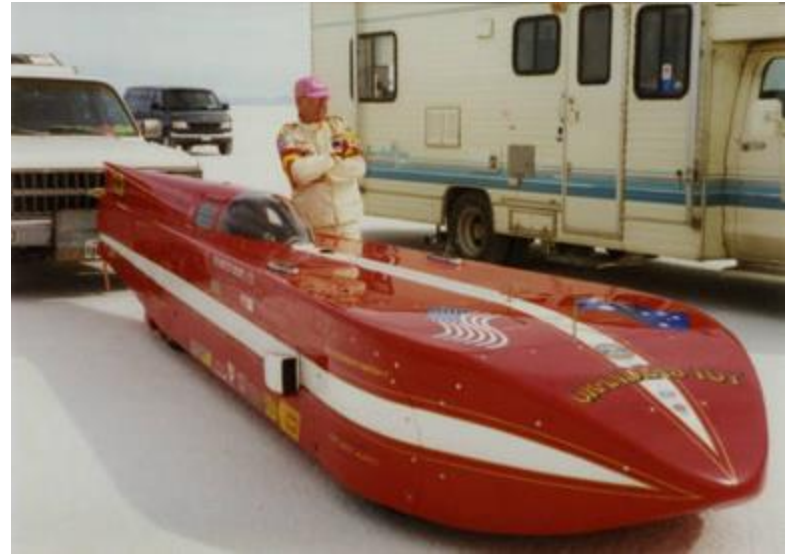
Auto racing in Utah: the Gary Dean Brown Collection [374] http://content.lib.utah.edu/cdm/ref/collection/UU_Photo_Archives/id/51836