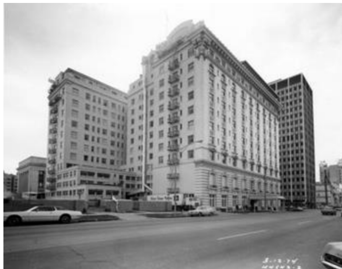
Before Remodeling, Hotel Utah, exterior [03] http://content.lib.utah.edu/cdm/ref/collection/hotelut/id/600

Name (including associated dates if available) Institution Collection Field(s) Type (personal name or corporate body) Cross references