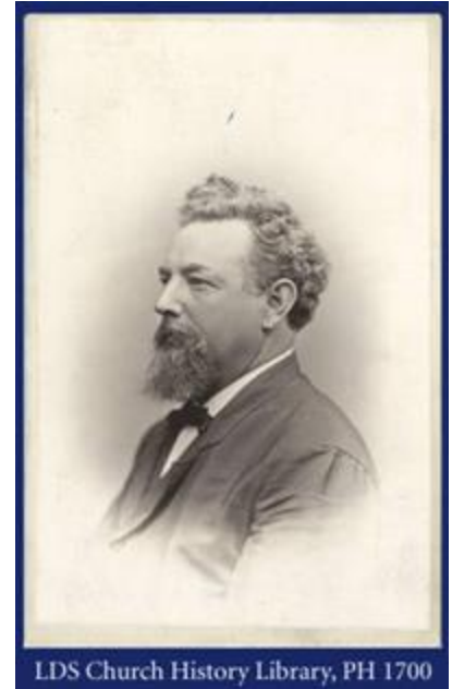
Charles R. Savage

Charles R. Savage, perplexed by his many name variants.