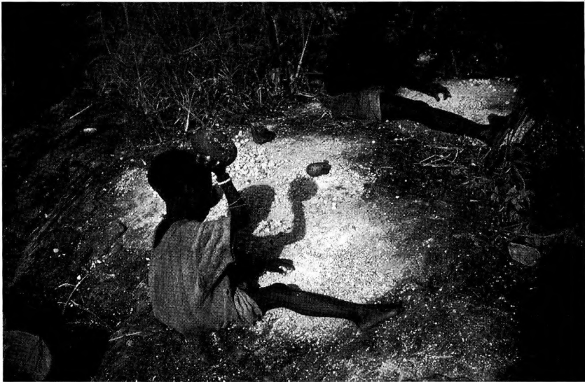
Figure 7.3 Some Hadza children processing baobab fruit in a camp

with no shade or water en route ), they would be as much help to their mothers and siblings if they stayed home and spent some time cracking mongongo nuts, just as Lee reports that they do. Thus we claim to have presented evidence of an economic explanation for this difference, dependent on the distribution of food and water in the environment, and differences in the processing costs of the highest-return foods. We also suggest that this difference in children's dependence on adults for food has important consequences for adult reproductive strategies.