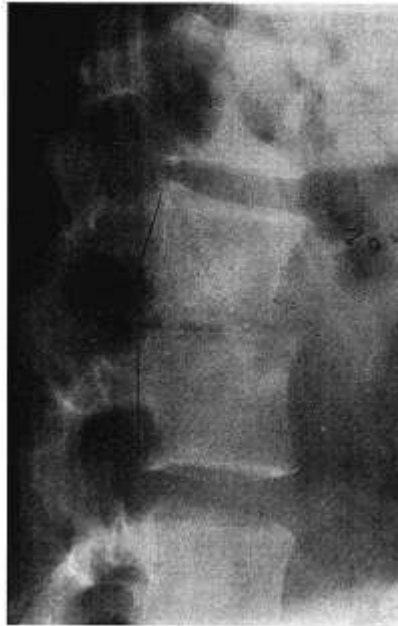
FIGURE 1. Radiograph of lumbar spine showing narrowing of the L-2-L-3 disc space and anterior cortical destruction.

A chest radiograph was normal. After the delivery of a healthy 6-pound 4-ounce boy, her temperature rose to 104° F. The common causes of postpartum fever were sought and were excluded. Her fever was unresponsive to broad-spectrum empiric antibiotic therapy. Physical examination revealed a firm mass in the anterior cervical lymph node chain as well as pain over the lumbar spine. Radiographs of the spine showed narrowing of the L-2-L-3 disc space as well as anterior cortical destruction (Figure 1). The patient refused to undergo a diagnostic biopsy of either