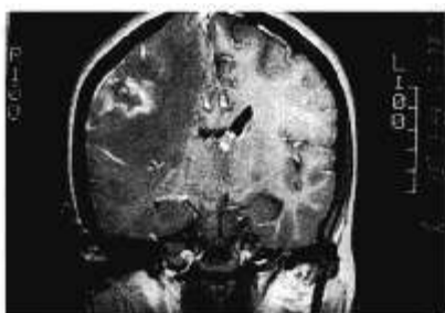
FIGURE 2. Magnetic resonance scan (coronal section) showing right parietal lobe brain abscess.

Discussion. Several issues are raised by this patient's presentation and subsequent medical management. The first is the delay in seeking medical attention because of her status as an illegal alien. The second is the effect of pregnancy or the postpartum state on the progression of tuberculosis. Third, there is the likelihood of development of drug-resistant organisms because of poor compliance with antituberculosis medications. The fourth issue is the ability of DOT to enhance markedly the likelihood of a successful outcome to therapy.