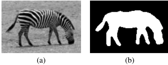
Figure 2: (a) Zebra image and (b) final segmentation.