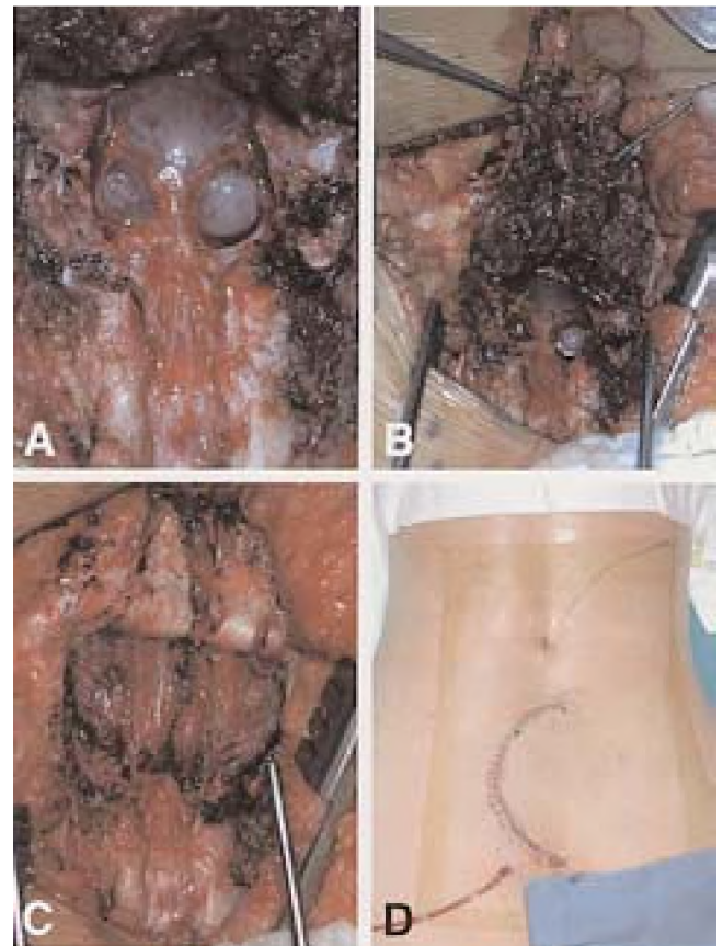
Fig. 2. A: Intraoperative view of a large Tarlov cyst. B: Intraoperative view of the muscle flap, divided in the middle, used for the obliteration of the cystic space. C: Intraoperative view after cyst wall resection showing sacral spinalis muscle flap rotated into position in the presacral space to obliterate the cyst cavity. D: Photograph obtained immediately after closure, demonstrating a U-shaped incision over the lumbosacral area, with a lumbar subarachnoid drain placed for postoperative CSF diversion.