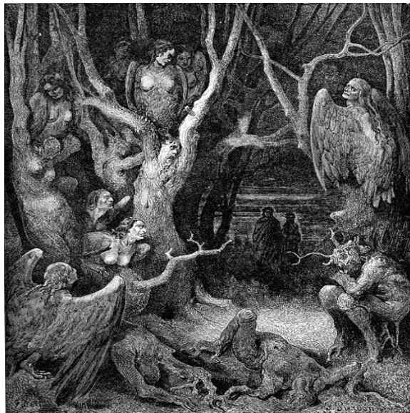
Figure 2: Harpies in the infernal wood , from Inferno XIII , by Gustave Doré, 1861

Besides a huge body frame and representations of the mouth, monsters often appear as human-animal hybrids, which “provokes horror and wonder by virtue of its refusal to be confined within any categorical system other than its own and yet its imminent arrival allows space for the consideration of a host of new possibilities, of new modes of being and doing” (Dixon, 2008, 671-672). In folklore and mythology, there is often a dichotomy created between the extreme beauty of princesses and human heroes, which is set against the extreme ugliness of the monster. Usually, the more complex and horrific the monster appears, the more satisfaction we get from their distinction. In the case of the two classic creatures, Medusa and the harpies (see Figures 2 and 3), we see