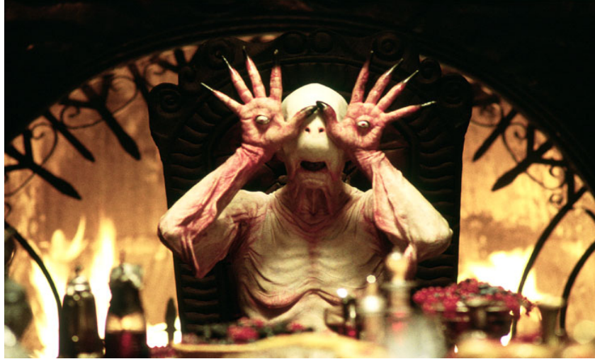
Figure 4: The Pale Man from Pan's Labyrinth , by Guillermo del Toro, 2006. (Screen shot from my personal DVD).

scene is utterly terrifying: with outspread eye-hands he chases her, ravenous for child flesh, until she narrowly escapes through a tiny hole in the ceiling. This monster represents the sum of all cannibalistic fears, infanticide, and true horror; however, the scene is also beautiful in its ingenuity and fascinating in the mythology and creativity of its motion. The complex dance of monster and heroine, chilling as it may be, was a stunning act of choreography and imagination.