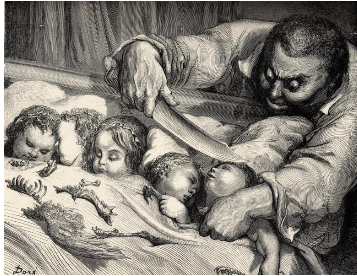
Figure 1: Ogres by Gustav Dore, 1765

of the human body. Ogres thus exist as a physical incarnation of our deep human fear of feeling weak and helpless, but they also represent our fantasies of being more powerful and more free from society's laws than we are. But it is not just their size that matters, because large beings do not necessarily incite fear in us if they do not have instincts of aggression or violence. Krell (2009) describes it this way: