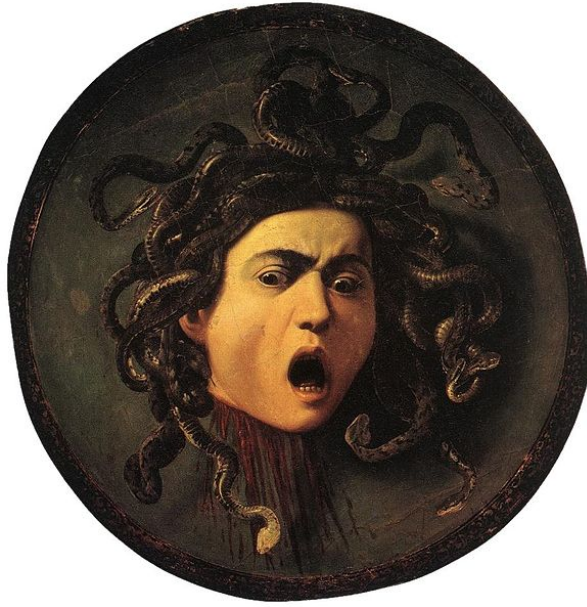
Figure 3: Medusa , by Caravaggio, 1595

representations of hideous women with bodies that are hybridized with animal anatomy. As we will see, these creatures represent complex social stigmas about women and the fear of women with power.