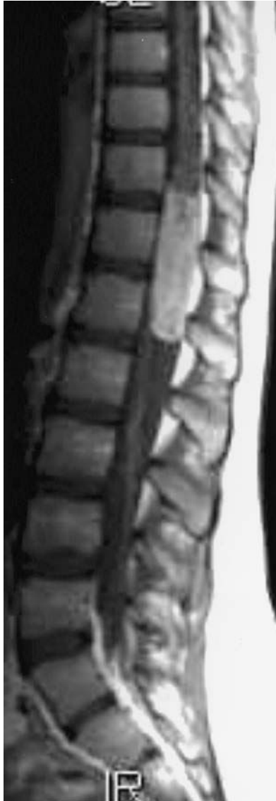
FIG. 1. Case 1. Preoperative MR image demonstrating a homogeneously enhancing primary tumor at the level of the conus medullaris (T11–L2) at the time of the initial presentation.

ness or weakness and had been treated with analgesic agents, which provided no relief. An MR image demonstrated a homogeneously enhancing sausage-shaped mass extending from T-11 to L-2 and enhancing sediment at the bottom of the thecal sac (Fig. 1). Preoperatively, MR images had been obtained in only the thoracic and lumbar spine. With the exception of an upgoing right toe the patient was neurologically intact. Resection of the primary tumor, including a T10–L2 laminoplasty and en bloc removal of the tumor for gross-total resection, was performed. The drop metastases in the distal thecal sac were not addressed surgically. Histopathological findings confirmed the diagnosis of MPE. Postoperative neurological examination revealed no change in her condition. On postoperative Day 1, an MR image of the entire CNS axis demonstrated gross-total tumor resection of the primary tumor mass, no evidence of cervical or intracranial disease, and residual drop